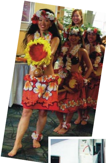
Hawaiian dancers welcome guests.