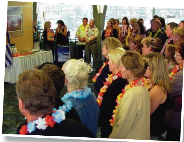
A well-attended launch included distinguished guests representing the tourism, public, and private industry sectors.